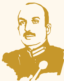
-Brigadier- Y.P Sethi